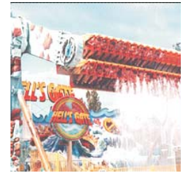
5. Hell's Gate