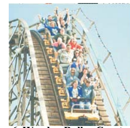
6. Wooden Roller Coaster