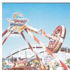
2. Crazy Beach Party