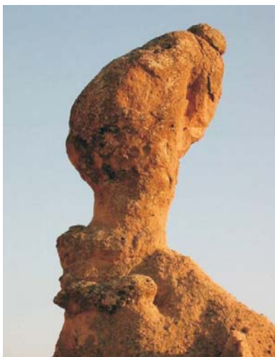
Think before you speak

these: if someone missed their bus or forgot to bring their homework to school, these cases are not so important, and you can use “that's too bad!”