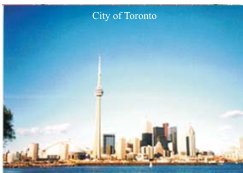
City of Toronto

Toronto is in the southeast of Canada. With a population of 2.5 million, Toronto is Canada's largest city and is the center of the fifth largest city region in North America. One quarter of Canada's populations lives within a 160 kilometers (100-mile) radius of Toronto. Compared with Vancouver, Toronto is much more crowded. Generally speaking, Toronto