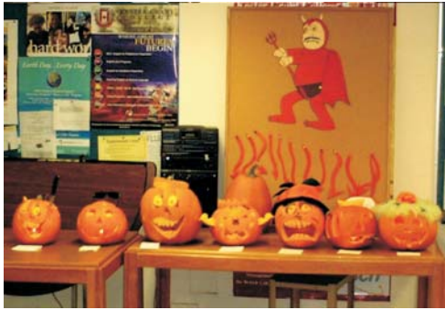
KGC Pumpkin Carving Contest 2003