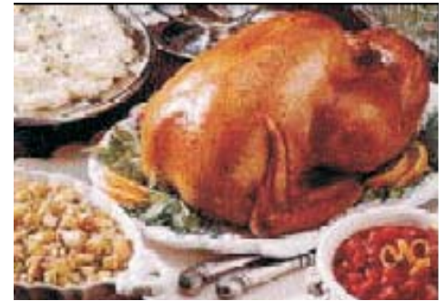
Thanksgiving.drbrainzlab.com days are different, the celebrations are similar.

Although Canadian and American Thanksgiving Days have a little are nce,